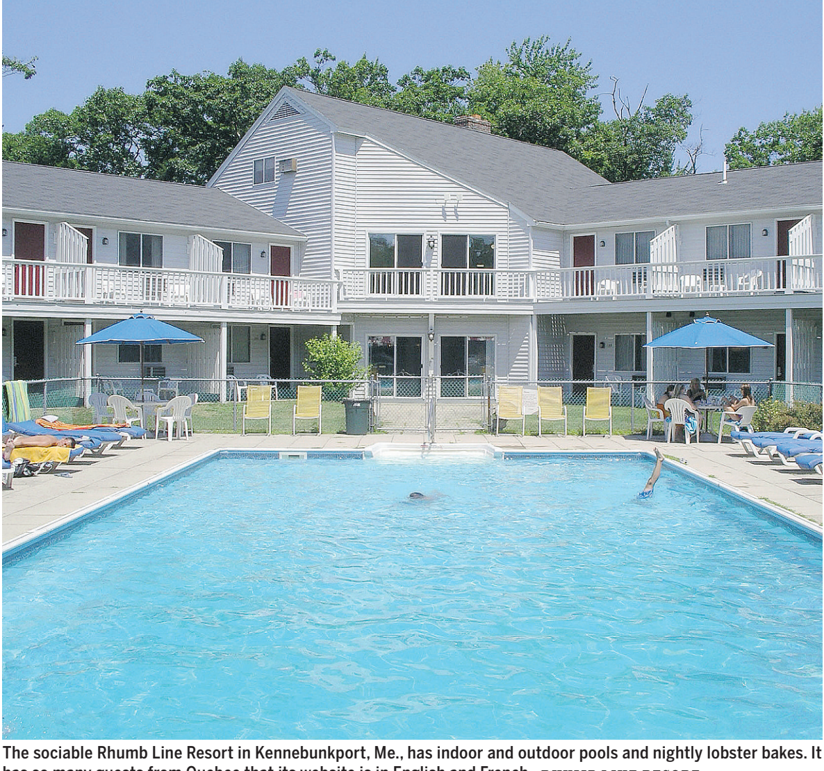
has so many guests from Quebec that its website is in English and French. RHUMB LINE RESORT