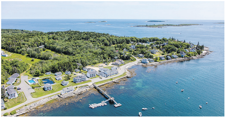
The picturesque Ocean Point Inn & Resort in East Boothbay, Me., has a variety of family-friendly accommodations. OCEAN POINT INN

home to shops, an 18-hole golf course, the Maine State Aquarium and the impressive Coastal Maine Botanical Gardens — one of New England's most impressive preserves of flora.